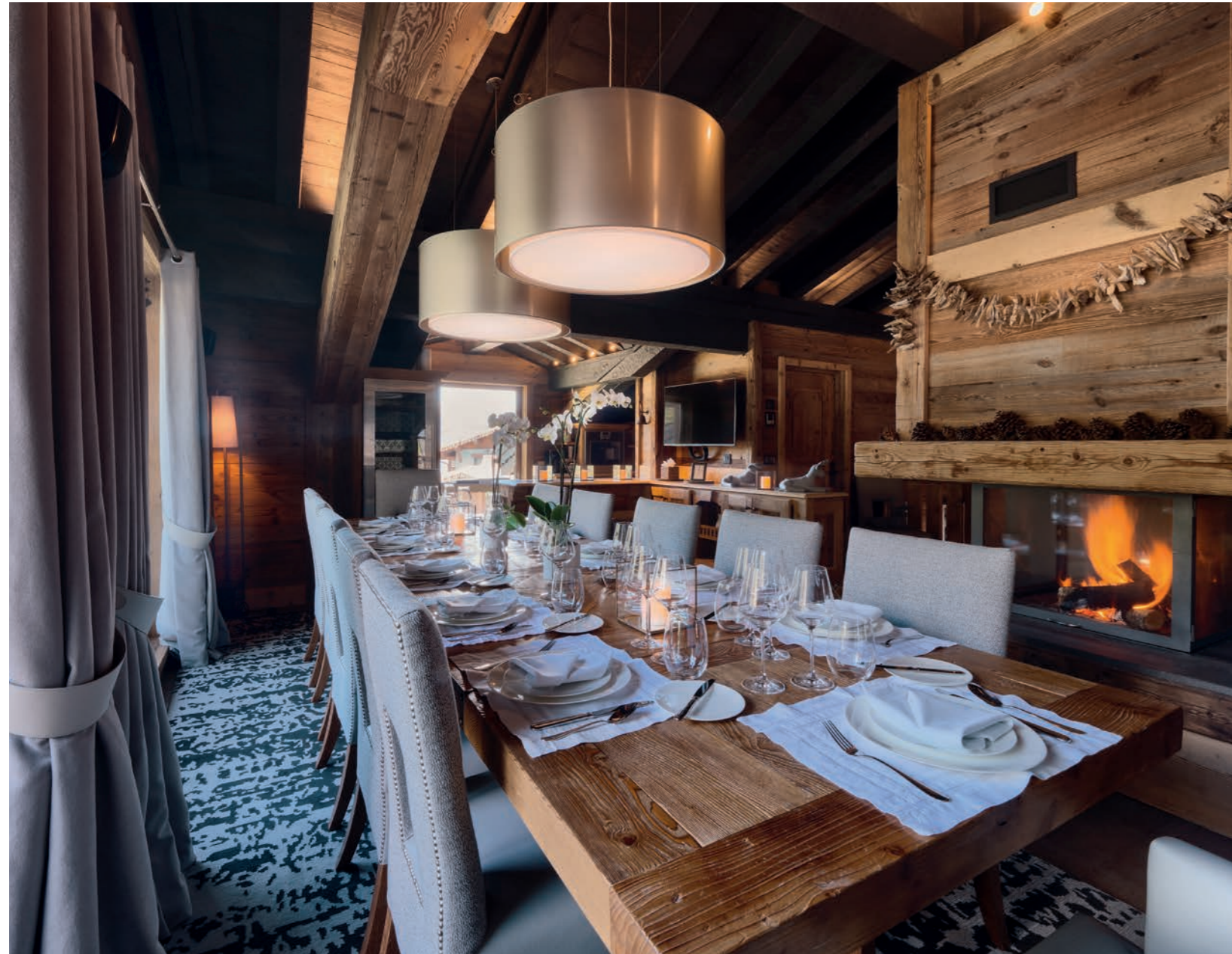
▲ ABOVE: Dining Area