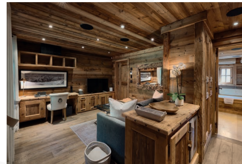
◀ LEFT: Master Bedroom ▲ ABOVE: Master Bedroom Lounge & Dressing Area

The master bedroom also features a private terrace which boasts inspiring views of the surrounding mountains, Bellecote Piste and the stars by night.