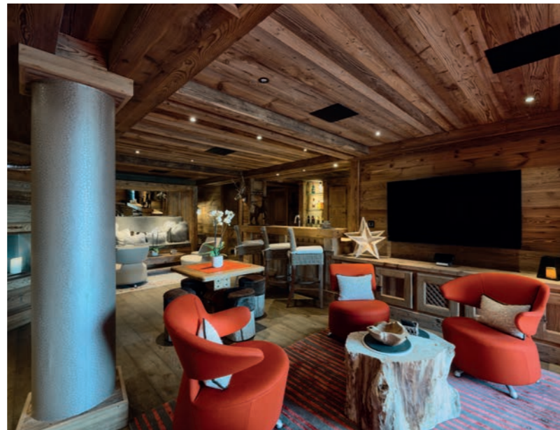
▲ TOP: Ski In Ski Out Room ▲ TOP RIGHT: Cinema ► BOTTOM RIGHT: Bar Lounge