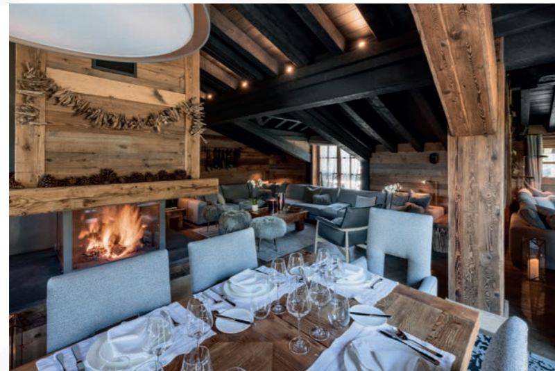
▲ ABOVE: Dining Area and Fire Place ▶ RIGHT: Lounge Area

On this floor you will find the lounge, TV room and the dining area which includes a fireplace and kitchen, making this the perfect place to dine with friends and loved ones, enjoy a few quiet moments of reflection or catch up with the day's news. The mountain views from every window are guaranteed to enthral.