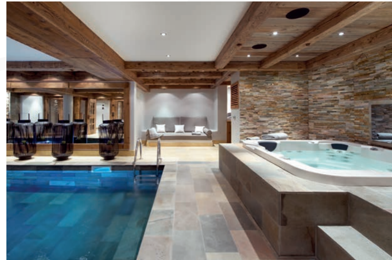
▲ ABOVE: Jacuzzi ► RIGHT: Pool

Soak tired muscles and let your mind drift away in the jacuzzi or the hammam steam room. You can also maintain your fitness regime in the state of the art gym.