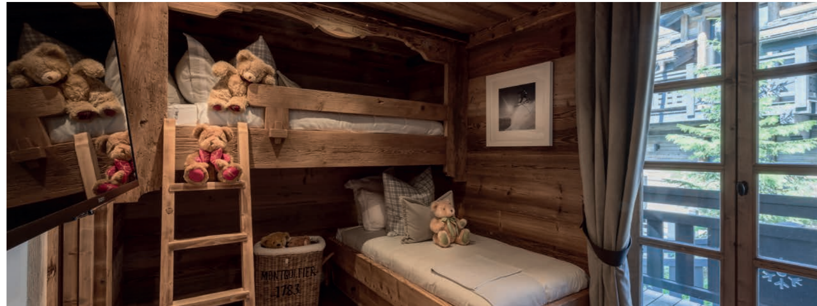
▲ TOP: Guest Bedroom 5 ▲ ABOVE: Bunk Room