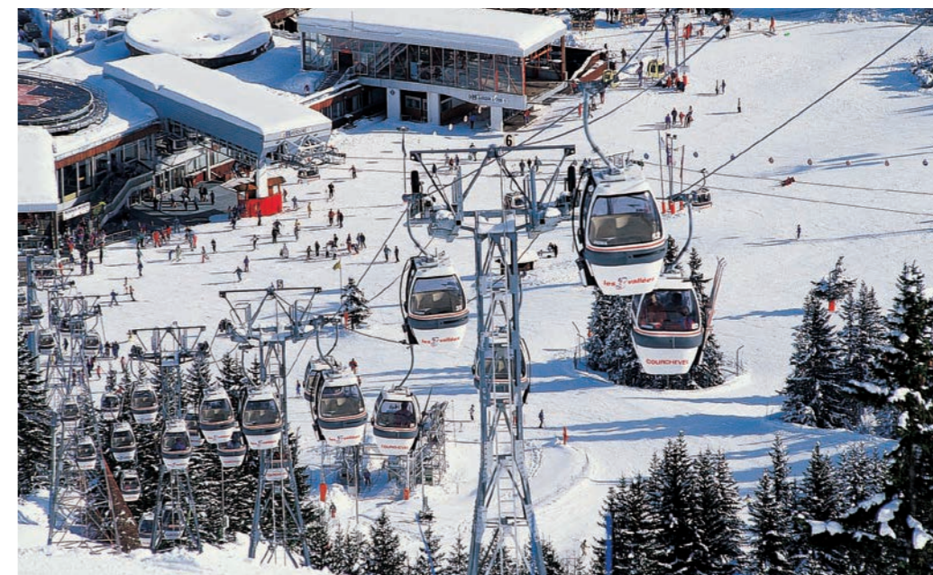
▲ TOP: Courchevel 1850 at night ▲ ABOVE: Courchevel 1850 Ski Facilities