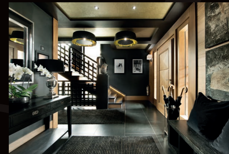
◀ LEFT: Le Petit Palais