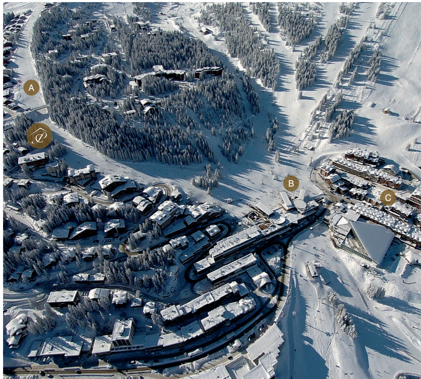
▲ ABOVE: Courchevel 1850 resort