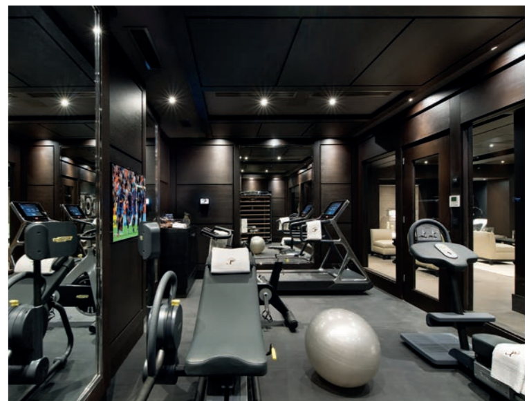
▲ ABOVE: Gym Area