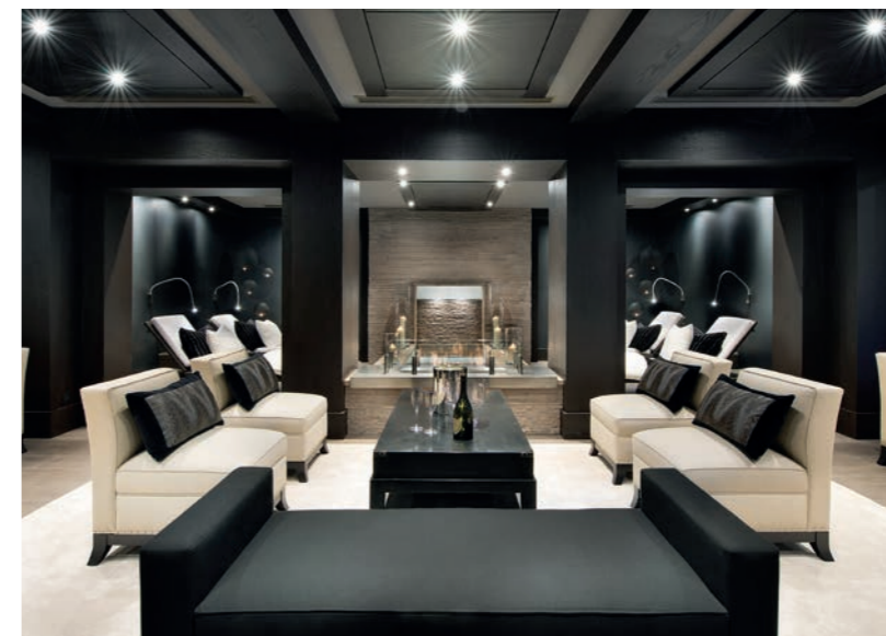
▲ TOP: Pool ▲ ABOVE: Spa Area