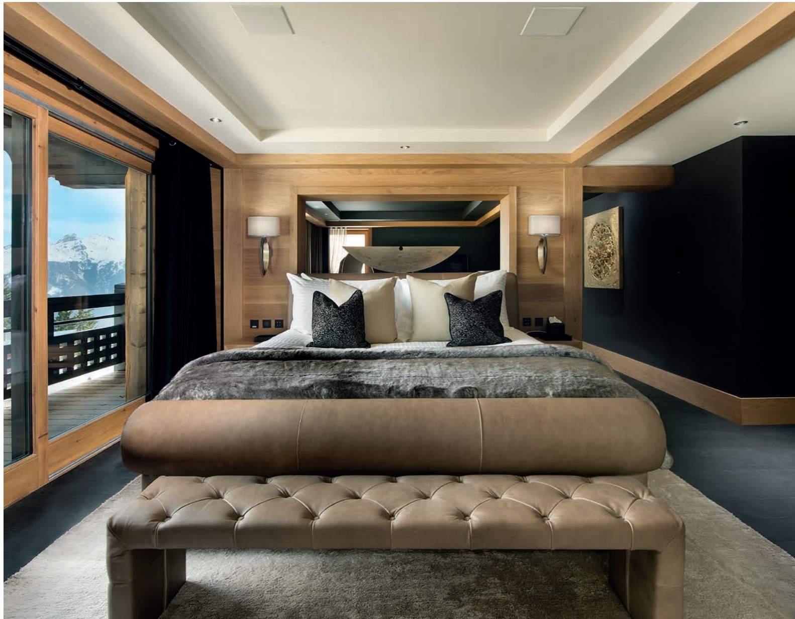
▲ ABOVE: Master Bedroom