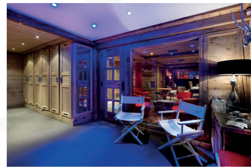
◀ LEFT: Bar Lounge ▲ ABOVE: Ski Room

The ski-in, ski-out room provides the perfect space to prepare for skiing, with equipment lockers, boot warmers and an inviting drinks area.