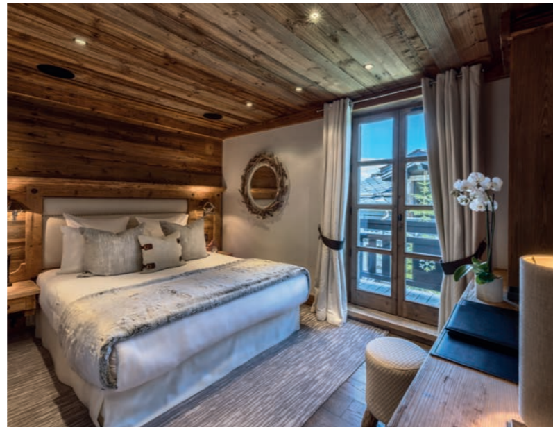
▲ TOP: Guest Bedroom 2 ▲ ABOVE: Guest Bedroom 2 En Suite ► RIGHT: Guest Bedroom 3