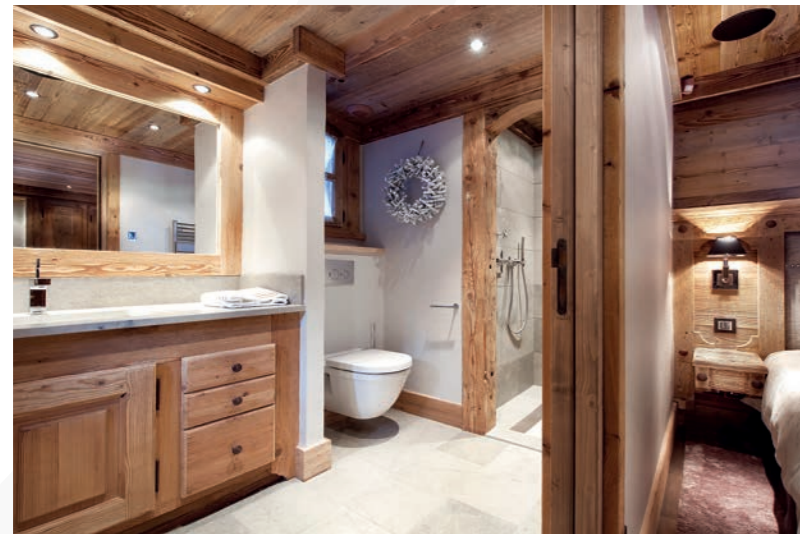
▲ ABOVE: Guest Bedroom 5 En Suite ▶ RIGHT: VIP Suite

From the main entrance you will find convenient storage space as well as access to the internal lift and staircase which both lead to all of the Château's floors, including private underground car parking.