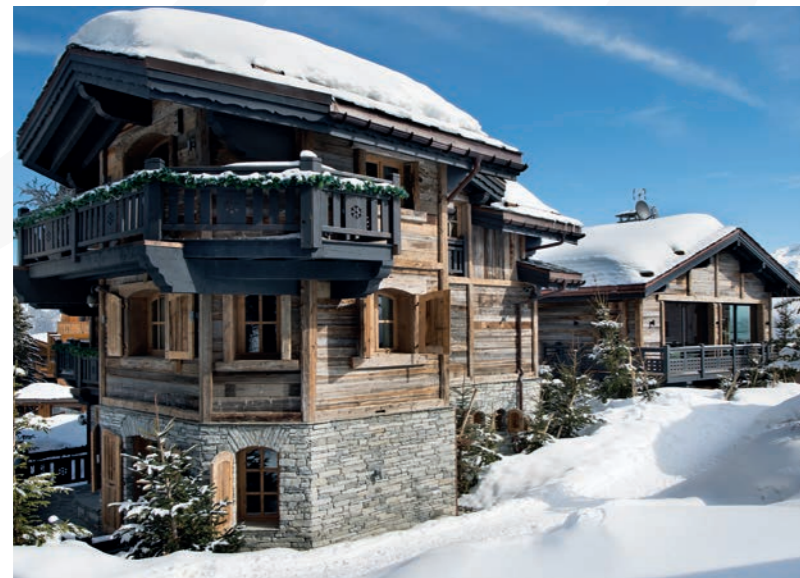
▲ ABOVE: Le Petit Château with underground access to Le Petit Palais

For larger parties Le Petit Château, offers a unique concept by a connected underground passage to Le Petit Palais allowing a link between our two designer chalets where you can host up to 30 guests in 14 exquisite bedrooms, whilst enjoying all the amenities and luxuries offered by both chalets.