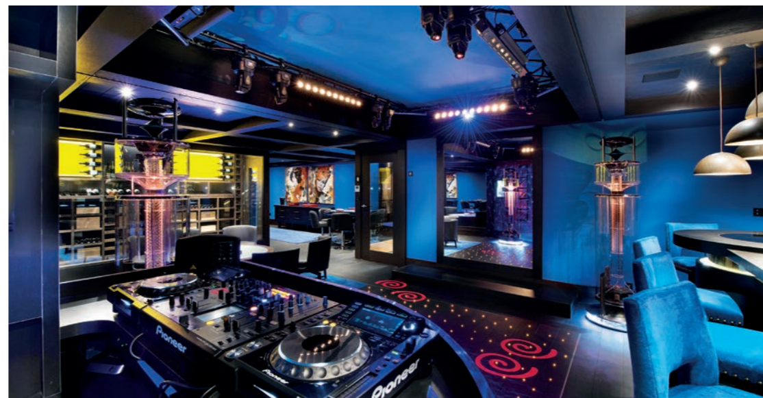
▲ TOP: Dining Area ▲ ABOVE: Bar Area