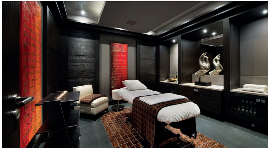
▲ TOP: Cinema ▲ ABOVE: Massage Parlour ▶ RIGHT: Lounge