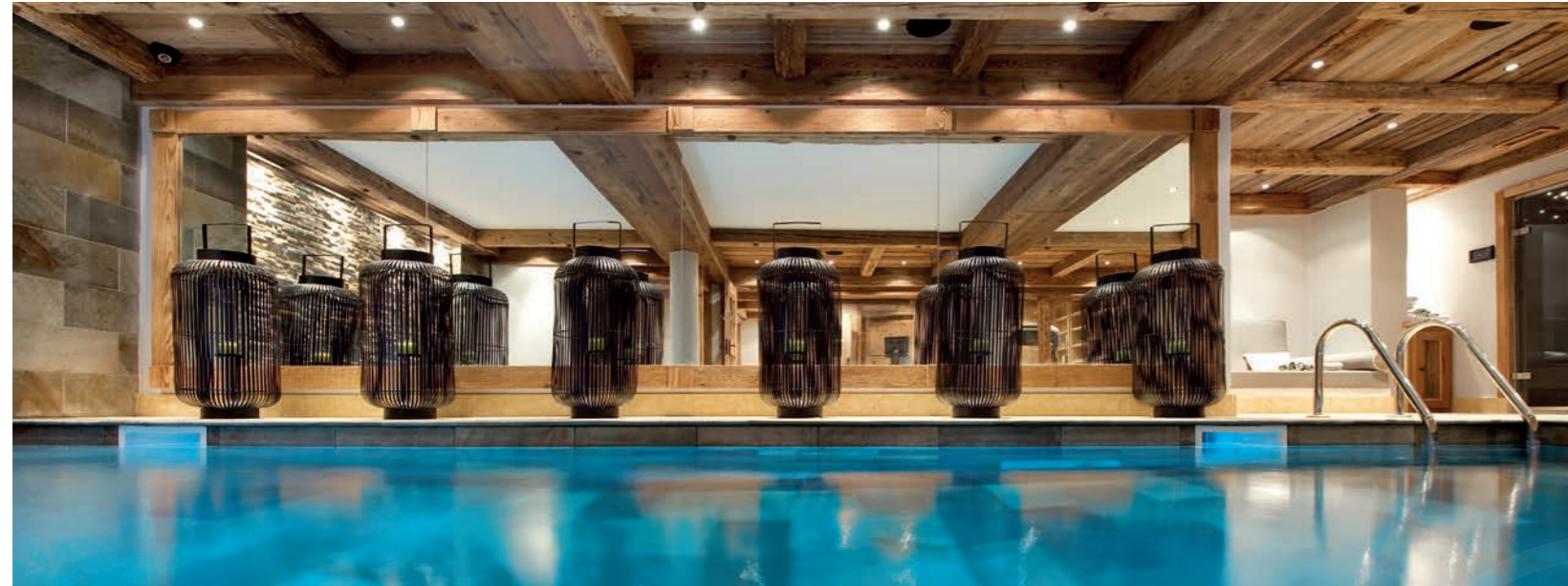
▲ TOP LEFT: Hammam Steam Room ▲ ABOVE: Pool ▶ TOP RIGHT: Massage Room